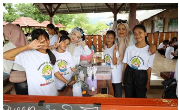
Figure 8. Market Day

The establishment of Sekolah Alam Anak Pesisir illustrates how multi-stakeholder collaboration can enrich grassroots initiatives. By co-creating a structured curriculum and providing tangible learning resources, Pertamina's CSR engagement moved beyond material assistance to become an enabler of innovative pedagogies. This resonates with scholarship on CSR in education, which emphasizes the potential for corporate actors to support not only infrastructure but also curriculum development and pedagogical innovation (Jamali & Karam, 2018). Importantly, however, the Sanggar maintained its grassroots orientation, ensuring that the program remained responsive to children's needs and community aspirations.