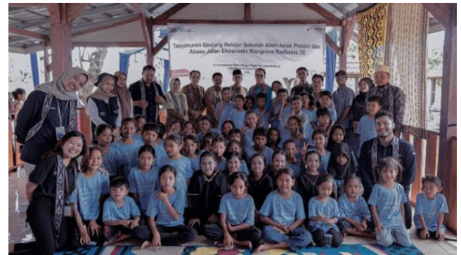
Figure 1. Learning and Recreational Space for Children provided by Pertamina

also environmental stewardship and livelihood awareness.