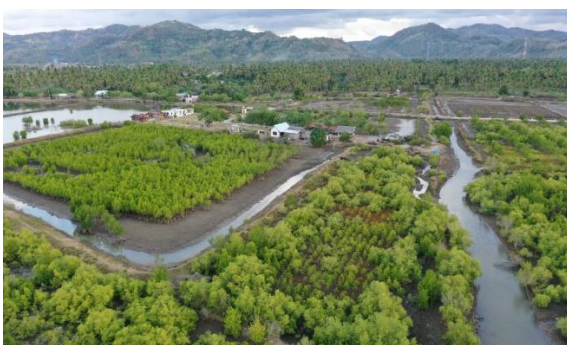
Figure 5. Drone view of the surrounding areas