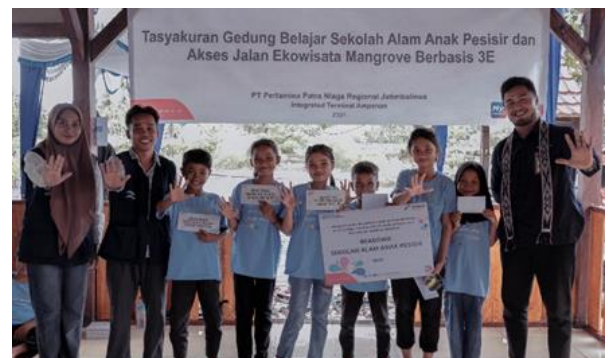
Figure 7. Scholarships recipients provided by Pertamina