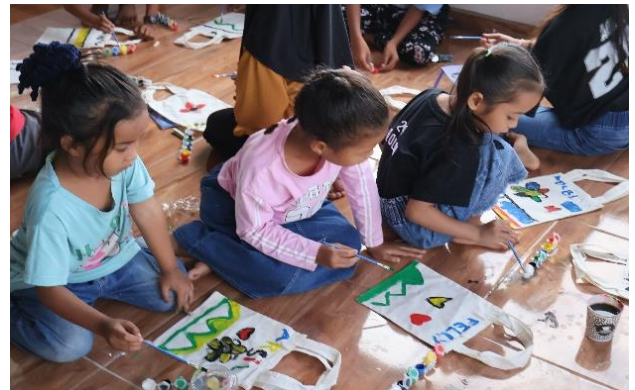
Figure 6. Drawing on tote bags