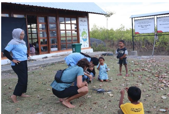
Figure 4. UAV or drone introduction