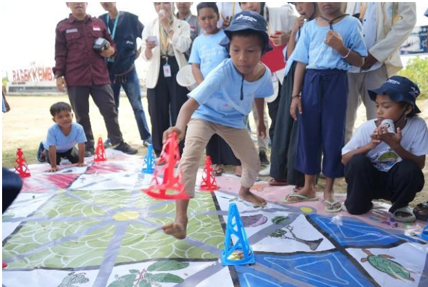
Figure 3. Children playing Perta-Kid

were incorporated to enhance self-expression and environmental messaging (Figure 6). Additionally, Pertamina provided scholarships to selected students, further strengthening the educational dimension of the program (Figure 7). As part of the economic pillar of the curriculum, children are introduced to basic concept of ecopreneurships through Market Day (Figure 8).